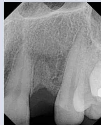
FIGURE 3—Pre-operative radiograph.