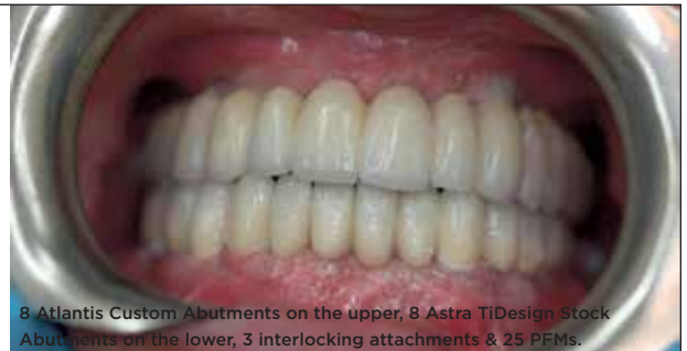
8 Atlantis Custom Abutments on the upper, 8 Astra TIDesign Stock Abutments on the lower, 3 interlocking attachments & 25 PFMs.

We don't need stock photography, we use real pictures of our cases to showcase our work. Our technicians are specially trained both internally and externally around the world with the best, helping them take implant and cosmetic dentistry to the next level. But, while cosmetic dentistry can improve a patient's look, we first focus on improving the strength, function and longevity of their smile.