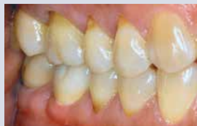
FIGURE 20—Final crown cemented, perfect prosthesis integration