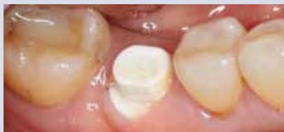
FIGURE 16—After four months of healing.