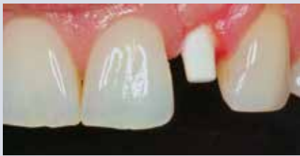
FIGURE 10 —Healed site up close showing soft tissue overgrowth.