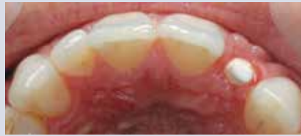
FIGURE 11 —Healed site occlusal view. Soft tissue profile is ideal.