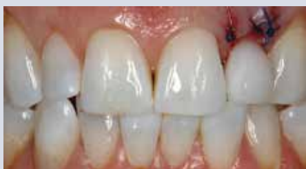
FIGURE 7—Provisional crown cemented immediately after surgery.