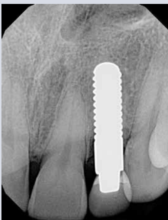
FIGURE 8—Post-operative radiograph.