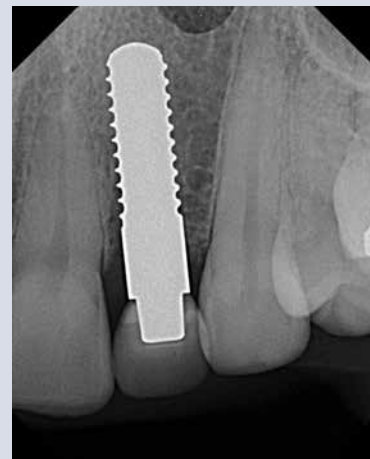
FIGURE 12 —Three-month radiograph. Nearly no bone remodeling is seen.

fabricated. The crown was tried in and inserted with a composite resin cement (Maxcem Elite, Kerr Dental) (Fig. 13). Occlusion was adjusted as to avoid lateral contacts. Special attention was made to adjust the final occlusion of the crown slightly in infra-occlusion, avoiding lateral contacts and the anterior guidance. This is important to compensate the elasticity of the periodontium of the neighboring teeth, in contrast of the rigidity of the ceramic implant and crown. The final result, one year after function, shows healthy soft tissue without any signs of inflammation around the CeraRoot acid-etched surface (Fig. 14). Moreover, the periapical radiograph shows that bone is stable around the implant and there is no evidence of early bone remodeling.