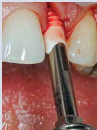
FIGURE 5—Implant being inserted with stainless steel driver.