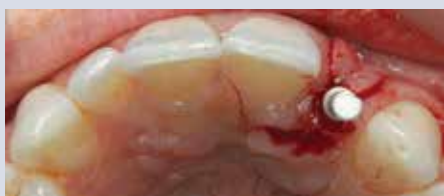
FIGURE 4—Site preparation and drill angulation.