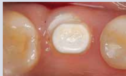
FIGURE 17—Occlusal view — note the soft tissue overgrowth.