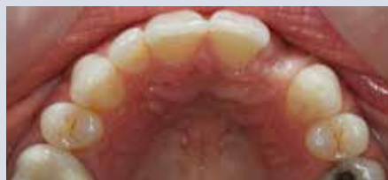
FIGURE 2—Pre-operative occlusal view.