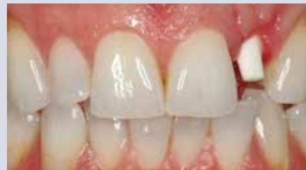
FIGURE 9—Healed implant three months post surgery.

used for seven days post operatively as well as Decadron 10mg with a three day tapering dosing regiment. One carpule of four percent articaine 1:200,000 epinephrine (Septocaine, Septodont Inc.) was used to anesthetize the operative area. A mini flap was raised sparing the papilla and the osteotomy was preformed utilizing very efficient ceramic drills at 300RPM, the slow drilling helps maintain the vitality of the bone. A closed mouth drilling technique was utilized to allow for ideal angulation (Fig. 4). A