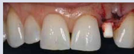
FIGURE 6—Immediately post surgery showing implant position.