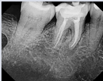
FIGURE 15—Pre-operative radiograph.