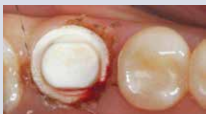
FIGURE 18—Margin exposed with soft tissue laser.