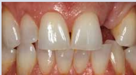
FIGURE 1—Pre-operative condition.