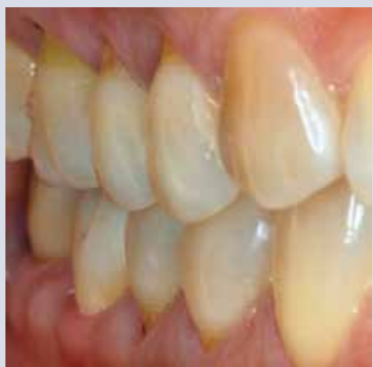
FIGURE 21—Beautiful soft tissue profile

this case. The implant was placed at >35\text{Ncm} of initial stability with the buccal restorative margin placed where desired about 0.5mm below the desired gingival margin. The voids around the implant were all sealed by the large transgingival collar and thus, no graft or sutures were used. The tooth was not temporized due to the posterior location of the site and the patient was instructed to