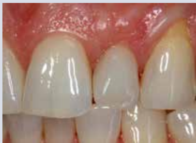
FIGURE 14 —One-year in function.